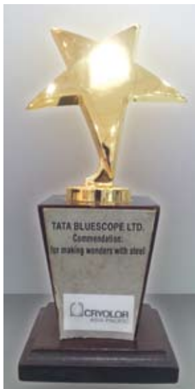
Award for Design Skills