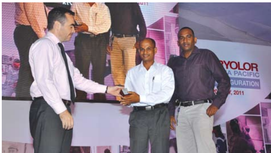
An award for Design Skills, a commendation for turning a beautiful but difficult design into reality and creating a wonder in steel.